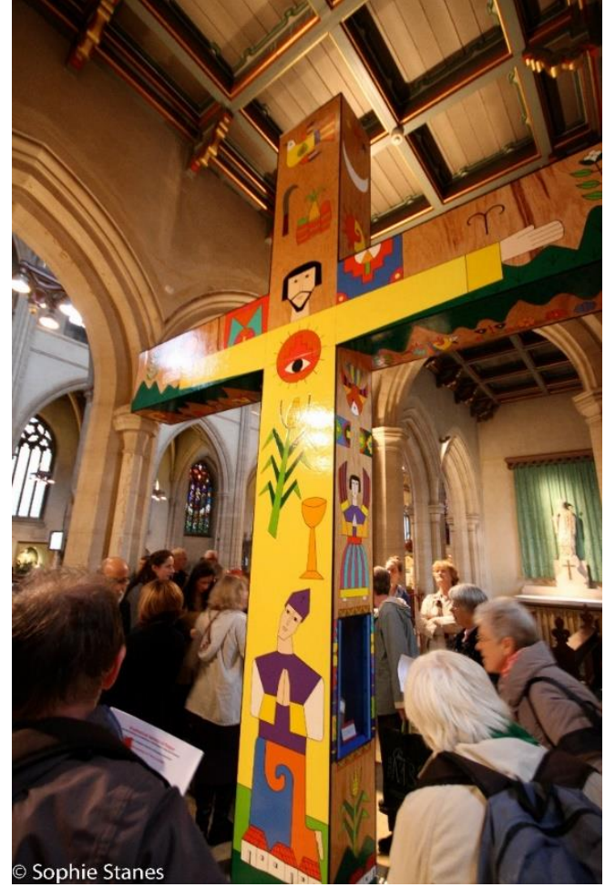
Cross of Ministry